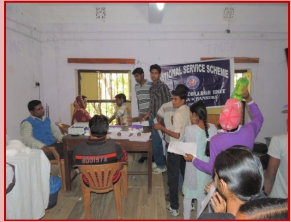
Thalassamesia Test Camp