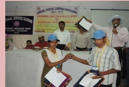
Our Youth Parliament Quiz Contest team was given Prizes after stood 3 rd in the district competition