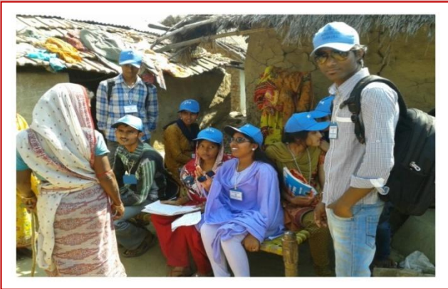
Campers during Village Survey