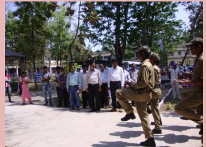
During N.S.S. Flag Hoisting on Inaugural Programme of the Camp with N.C.C. Parade of the College