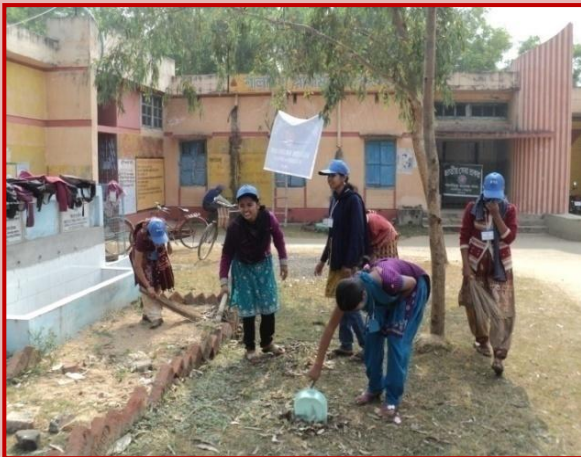
Hospital Cleaning Programme