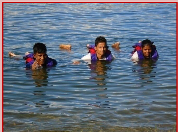
NSS Volunteer took part in adventure camp