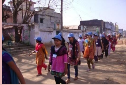
During Village Survey