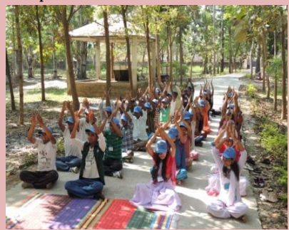
Everyday Yoga and Parade during Camp Period