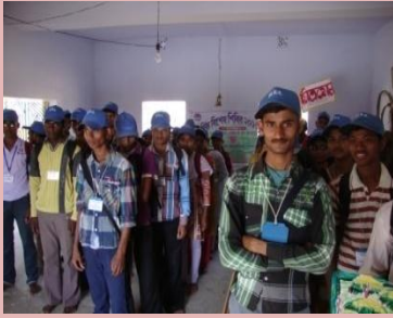
Ready to village Survey