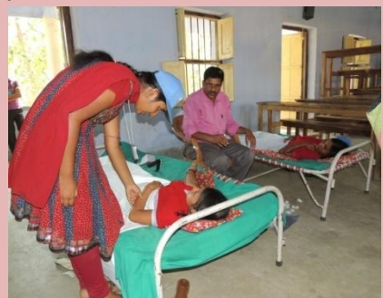
Blood Donation Camp during Special Camp