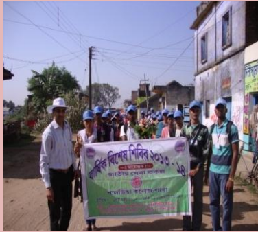
During Village Survey