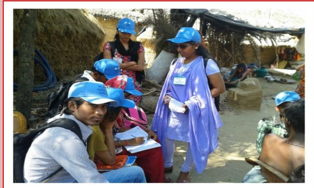
Campers during Village Survey